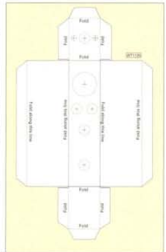
Fig. 4: Dimension for the bracket - which can be formed from aluminium sheet (see text).