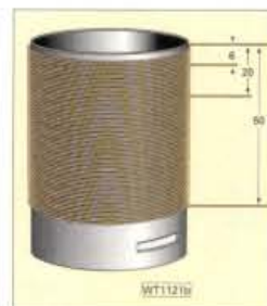
Fig. 3a & b: Coil winding details for the wavemeter project (see text).