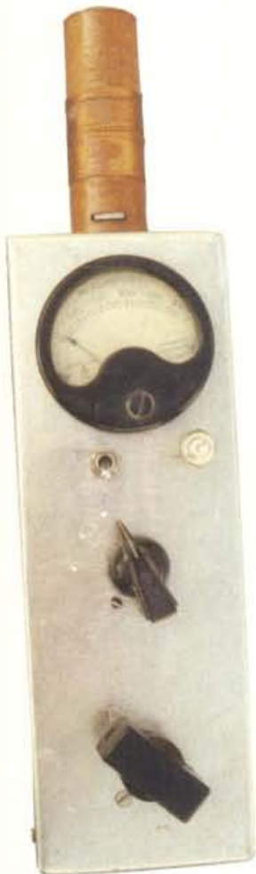
The simple absorption wavemeter project described by Carmel 9H1AQ.