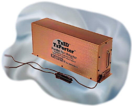
Figure 2 – The TxPorter For Mobile Use With Laptop Computers

nected to the interface adapter using shielded cable.