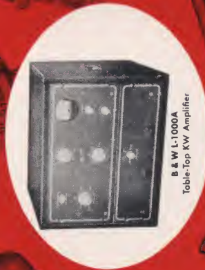
B & W L-1000A Table-Top KW Amplifier