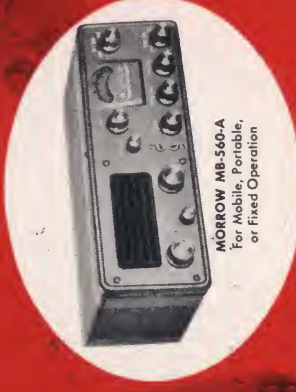
MORROW MB-560-A For Mobile, Portable, or Fixed Operation