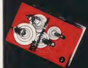
RCA TRANSMITTING TUBE MANUAL—TT-4 256 fact-filling pages covering 108 power-tube types and 13 vacuum-tube types. Includes cap catalog and useful hints. See your RCA Tube Distrib- utor. Or send $1.00 to RCA, Commercial Engineering Sec- tion, 1-381A, Harrison, N. J.

Known by the signals they deliver—and the brand of tubes they use—these remarkable "leading designs" are making amateur-communication history. And their designers know that top-quality equipment requires top-quality tubes in the sockets.