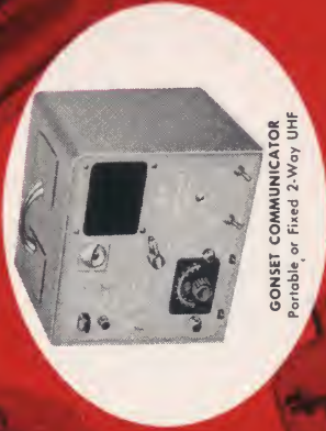
GONSET COMMUNICATOR Portable or Fixed 2-Way UHF

Devices and arrangements shown or described herein may use patents of RCA or others. Information contained herein is furnished without responsibility by RCA for its use and without prejudice to RCA's patent rights.