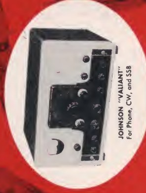
JOHNSON "VALLIANT" For Phone, CW, and SSB

DESIGNED FOR "100% QSO" .... they use RCA TUBES