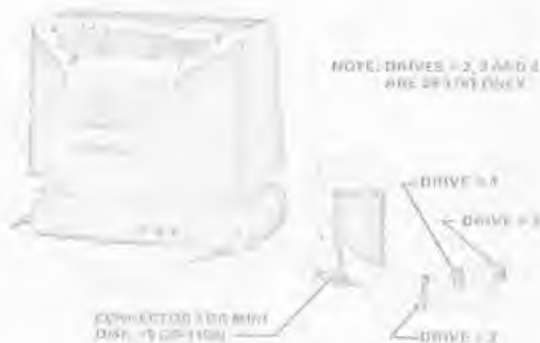
FIGURE 2 Interconnect between the Mini Disk and the TRS-80 Expansion Interface.