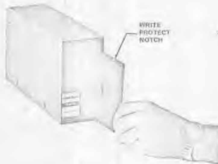
FIGURE 3 Inserting the Diskette.

Before any read or write operation, the motors will have been turning for at least one second to ensure the Diskette is rotating at the proper speed.