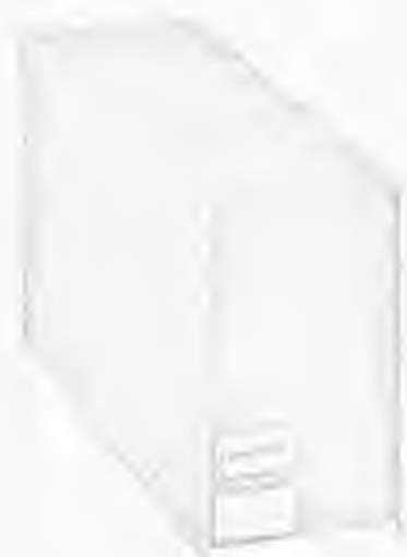
FIGURE 1 Mini Disk

The TRS-80 Mini Disk's AC connector must be grounded to the 120 VAC, 60Hz supply.