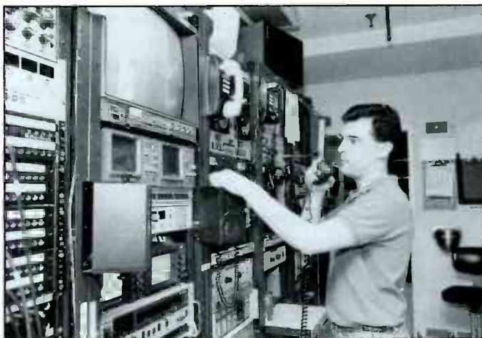
Taking in feeds from various sources is part of the duties of an Electronic News Gathering (ENG) crew.

opportunity to create a visually appealing and journalistically sound product limited only by his or her imagination and creativity.