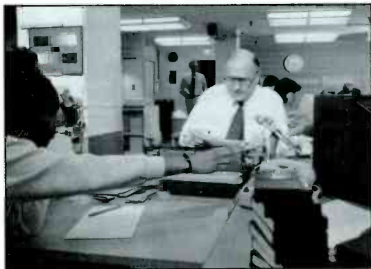
An assistant director cues a news anchor during a live update.

The position of news director is generally the high point of a long career in broadcast journalism. News directors almost always