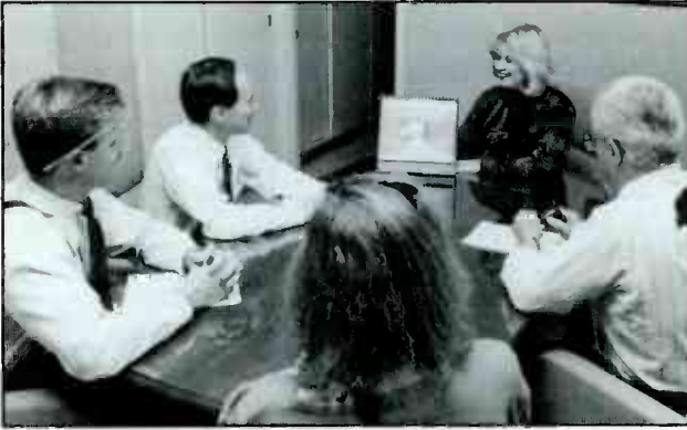
Giving presentations to potential clients is just one part of an account executive's duties.

A television station is above all else, a business . . . and an expensive business to maintain. Most of the money to support a station comes from advertising revenue.