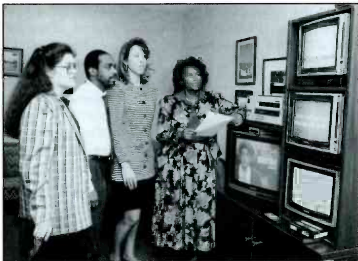
Program directors screen many shows before making up the weekly, monthly or quarterly schedule.

The PRODUCTION ASSISTANT role may have been the gateway to a television career for more top local and national broadcasters and production executives than any other position in a station. This is the ideal entry-level position for anyone interested in a career in almost any aspect of television. This job essentially amounts to an apprenticeship in television.