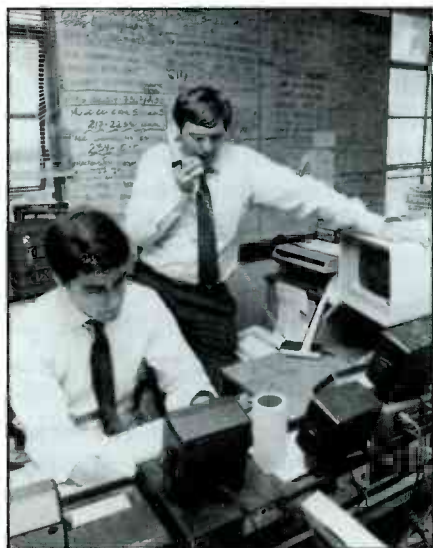
The list of the day's stories is displayed near the assignment desk. Editors are constantly monitoring police and fire department scanners for breaking stories.

Two of the most common specialty reporting positions in local television are SPORTS REPORTER and WEATHER REPORTER . Many sports reporters are former athletes, however much more than athletic ability and background is now expected of a successful sports journalist. The sports reporter may be called upon to cover the business, political and social aspects of athletics in the