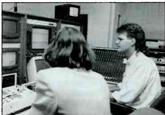
Working with an assistant director, a program editor pieces together a local show to be aired at a later time.

The planning and production of local programs broadcast by a television station takes place in the programming department. This department also determines which shows produced independently will be acquired by the station. If the station is affiliated with a network (ABC, CBS, NBC or FOX) or the public television network (PBS), the programming department is the station's liaison with the network. If the station is owned by a large broadcast group, the programming departments of the group stations often work together to develop shows for that group or for sale elsewhere.