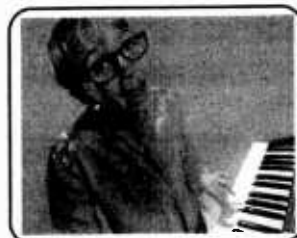
A little "Elton"

Seems great minds think along the same lines.