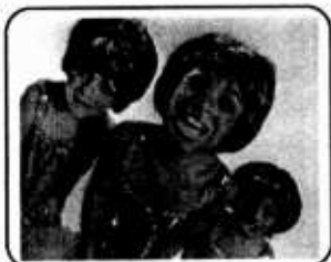
(A little "Supremes")

Kids. This spot features artist lookalikes (that is, what they likely would have looked like at a prepubescent age), lip-syncing power gold hits. Best for a female-targeted format (AC, Soft AC, Jammin' Oldies) since women are more likely to be attracted to a TV spot featuring children.