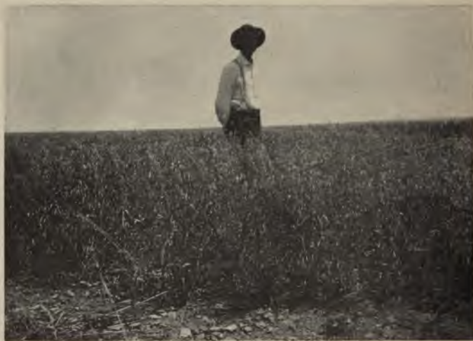
OATS AFTER A MOISTURE-SAVING FALLOW, YIELD 37 BUSHELS PER ACRE, FORSYTH DRY-FARM, MONTANA

Showing evil effect of constant cropping without summer fallowing or rotation