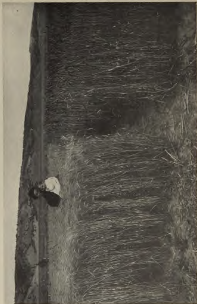
TWO VARIETIES OF DRY-LAND WHEAT, RED CROSS AND TURKEY RED, U. S. EXPERIMENT STATION, NEWCASTLE, WYOMING