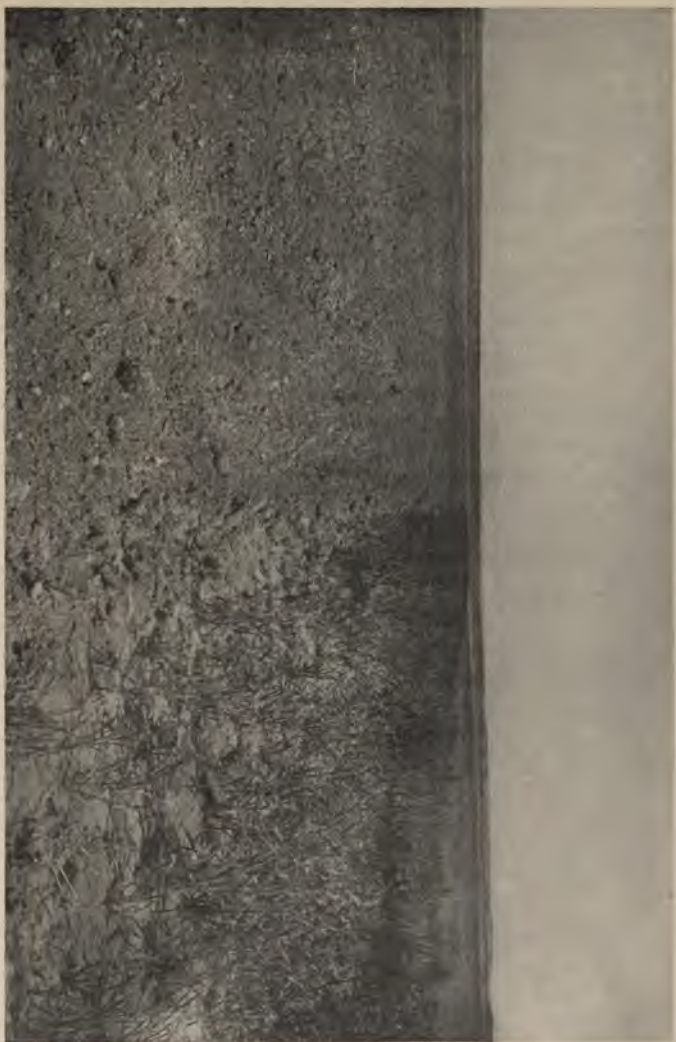
THE OLD METHOD AND THE NEW Tilled and Crushed Fallow Land in Montana