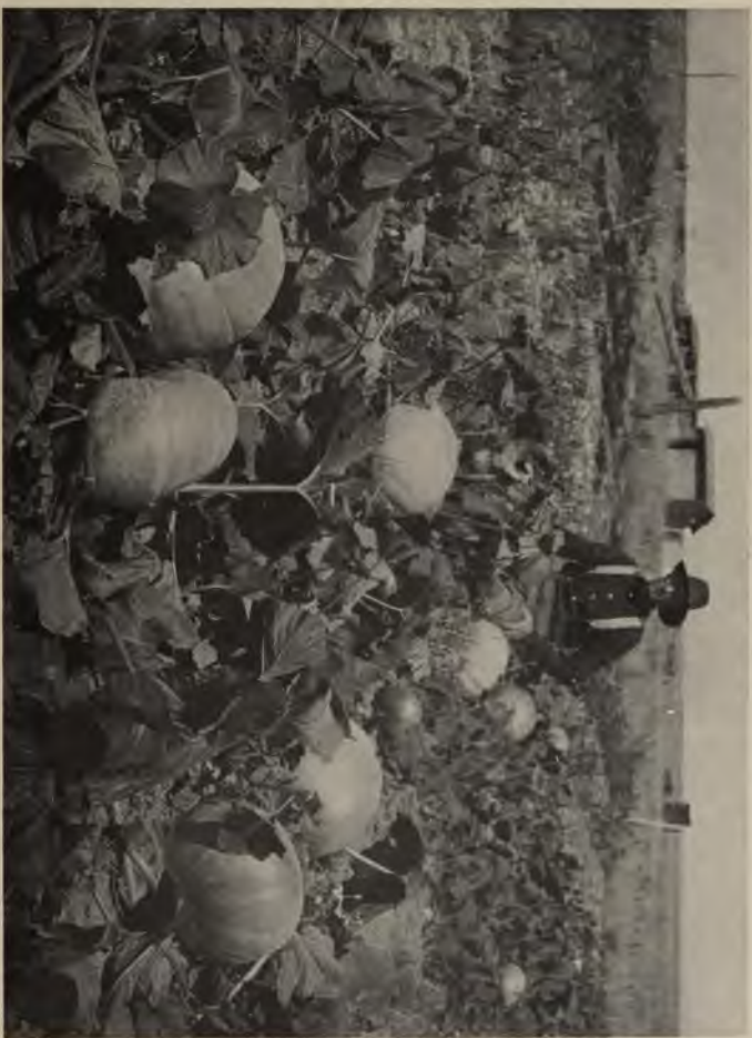
DRY-FARM SQUASH, FORSYTH EXPERIMENT STATION, MONTANA