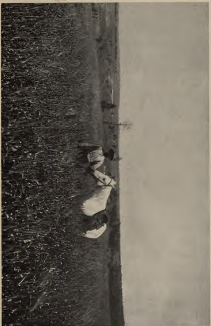
DRYLAND WHEAT, CHRISTENSEN RANCH, WYOMING