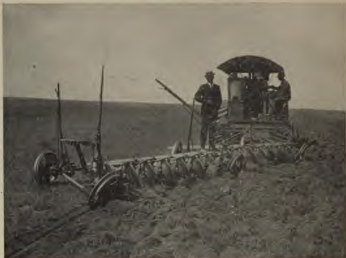
A GASOLINE-TRACTION PLOWING OUTFIT AT WORK ON A 3000-ACRE FARM IN MONTANA