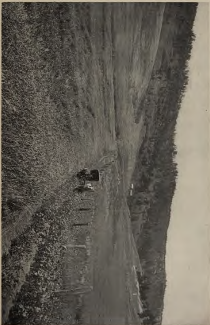
A DRY-FARM IN NORTHERN WYOMING.