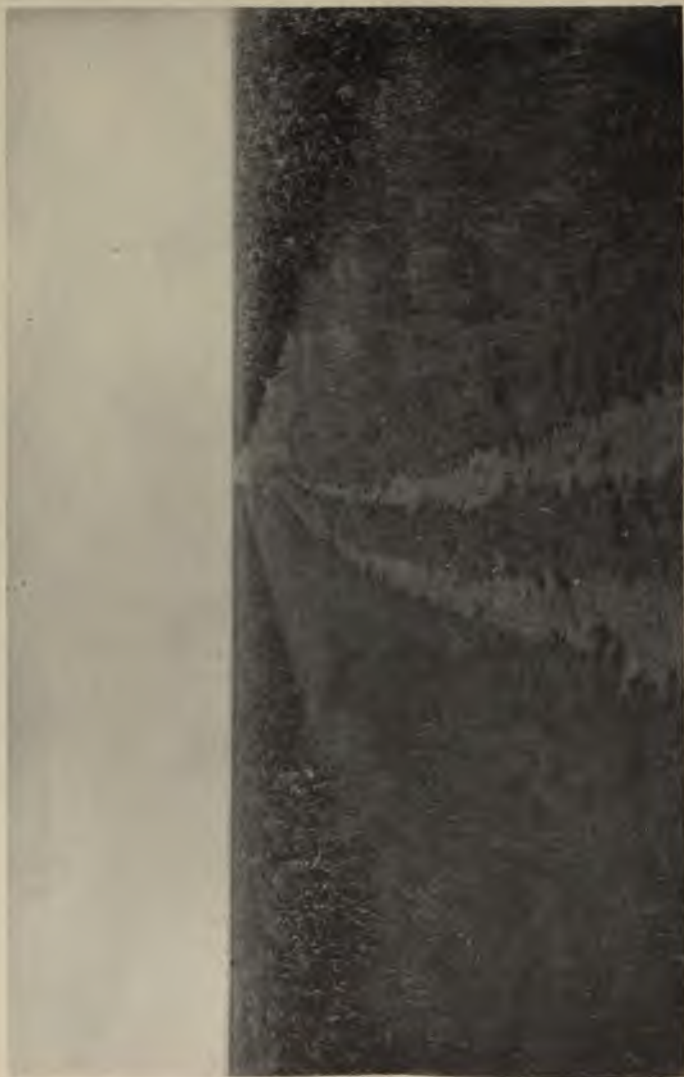
A DRY-FARM IN SOUTH AFRICA, SHOWING TWO MILES OF MAIZE