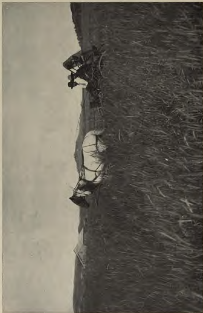
EASTERN SECTION OF WYOMING, NEAR LUTHER Cattle Range until 1907