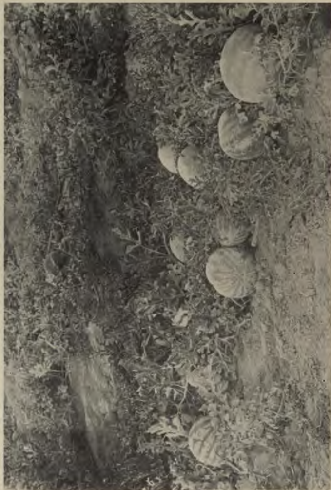
DRY-LAND MELONS GROWN ON THE BENCH LANDS OF MONTANA