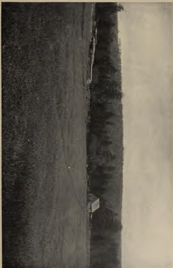
A DRY-FARM HOME NEAR NEWCASTLE, WYOMING

The east-field in the foreground shows how luxuriantly grains will grow without irrigation when deep plowing and intense cultivation are practised