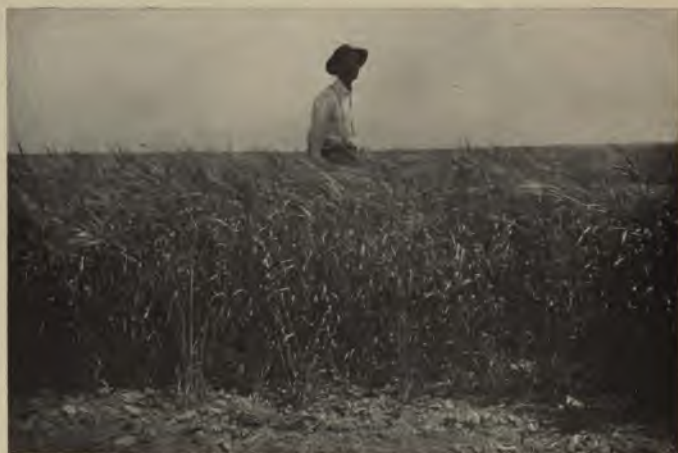
WHEAT AFTER A MOISTURE-SAVING FALLOW, YIELD 25 BUSHELS PER ACRE, FORSYTH DRY-FARM, MONTANA

Showing evil effect of constant cropping without summer fallowing or rotation