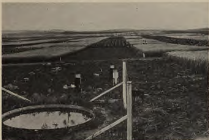
ROTATION PLOTS AT THE EDGELEY EXPERIMENT STATION, NORTH DAKOTA