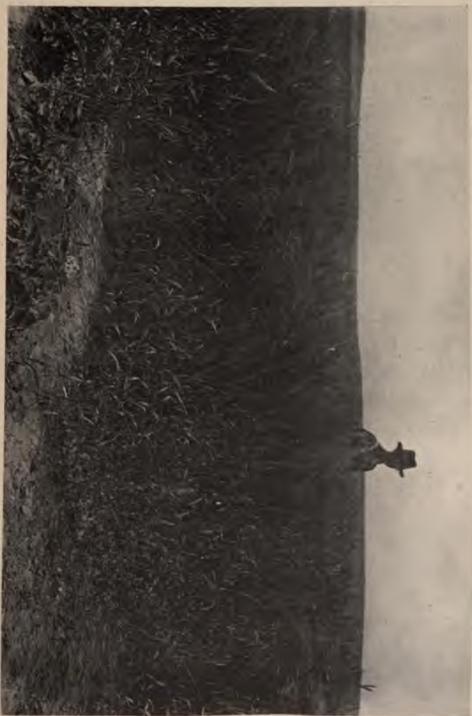
FALL WHEAT, TURKEY RED, FORSYTH DRY-FARM, MONTANA