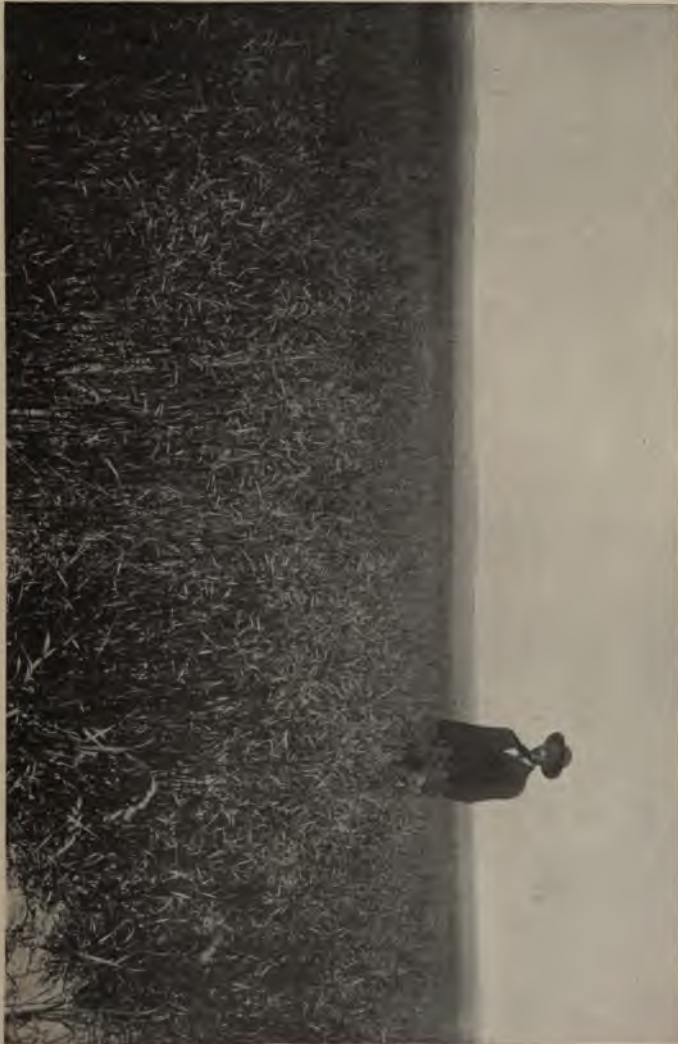
DRY-LAND BROWN GRASS, 14 TONS PER ACRE, FORSYTH, MONTANA