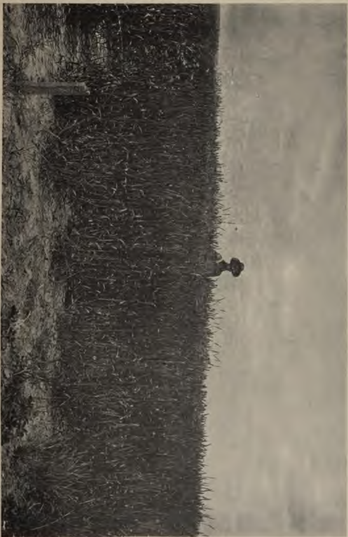
DRYLAND, GOLD-COIN FALL WHEAT, 55 BUSHELS PER ACRE