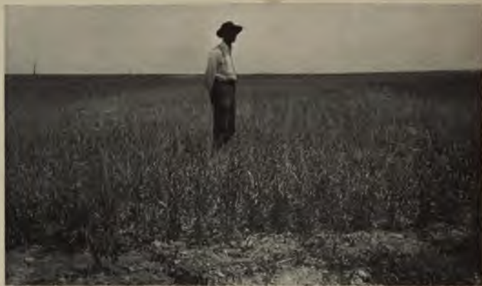
OATS GROWN CONTINUOUSLY, THIRD CROP, YIELD 8 BUSHELS PER ACRE, FORSYTH EXPERIMENT STATION, MONTANA

Showing evil effect of constant cropping without summer fallowing or rotation