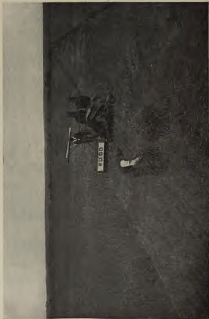
HARVESTING ON A WYOMING DRY-FARM