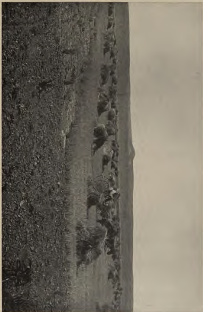
DRY-LAND WHEAT IN SHOCK, FORSYTH, MONTANA