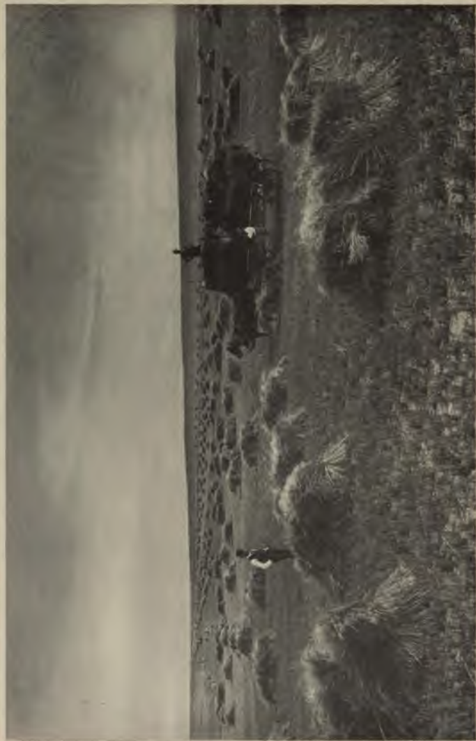
DRY-LAND WHEAT, U. S. EXPERIMENT DRY-FARM, CHEYENNE, WYOMING