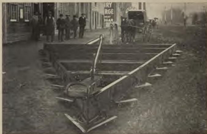
THE BATES GRUBBER FOR CLEARING SAGE-BRUSH Pulled with 35 H. P. Engine