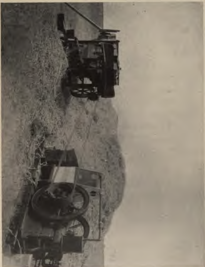
A SMALL, THRESHING OUTFIT, BELLEFOURCHE EXPERIMENT STATION, SOUTH DAKOTA