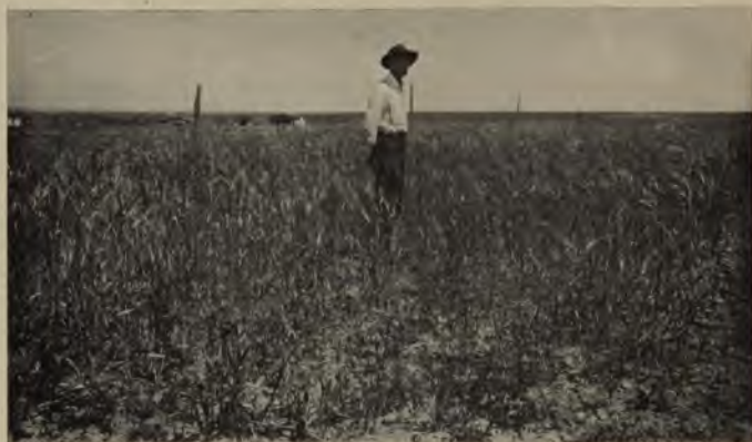
WHEAT GROWN CONTINUOUSLY, THIRD CROP, YIELD 4 BUSHELS PER ACRE, FORSYTH DRY-FARM, MONTANA

Showing evil effect of constant cropping without summer fallowing or rotation