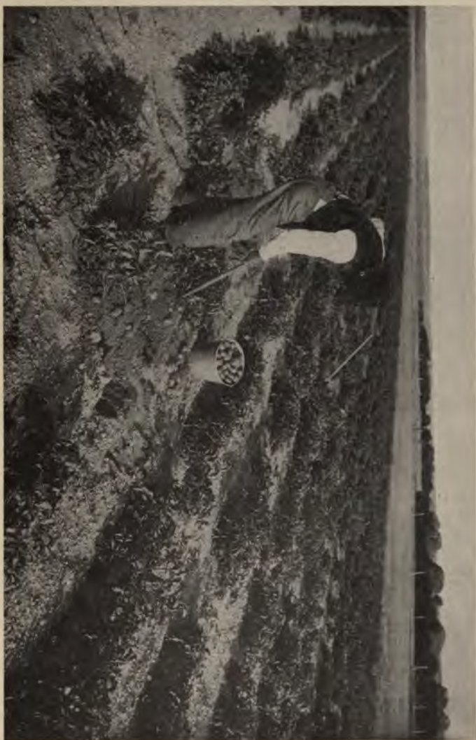
HARVESTING DRY-LAND POTATOES