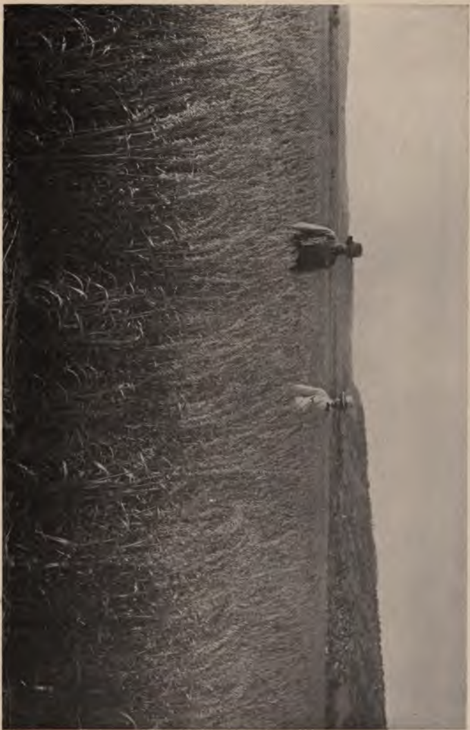
DRYLAND OAT-FIELD (NEBRASKA WHITE), U. S. EXPERIMENT STATION, NEWCASTLE, WYOMING