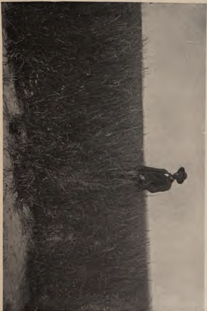
TALL OAT GRASS GROWN ON THE DRY FARMS OF MONTANA