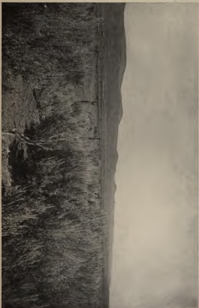
SAGE-BRUSH, DESERT OF UTAH