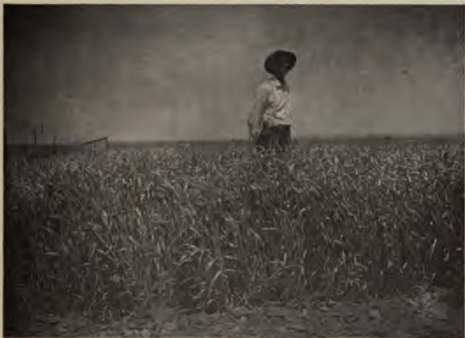
BARLEY AFTER A MOISTURE-SAVING FALLOW, YIELD 25 BUSHELS PER ACRE, FORSYTH DRY-FARM, MONTANA

Showing evil effect of constant cropping without summer fallowing or rotation