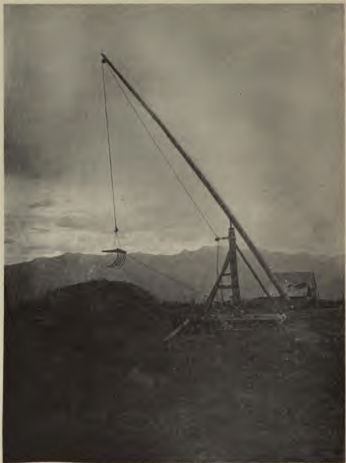
A HAY AND GRAIN DERRICK Used for Stacking Hay and Wheat in the Cache Valley, Utah