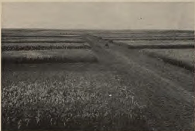
ROTATION PLOTS AT THE EDGELEY EXPERIMENT STATION, NORTH DAKOTA