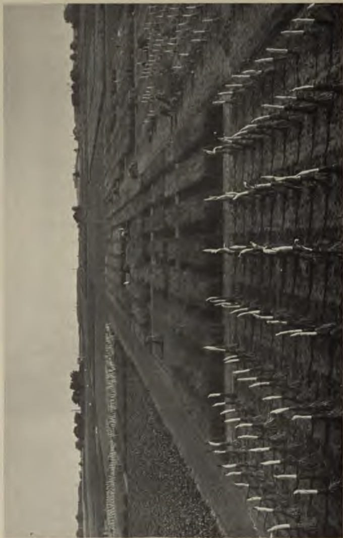
WHEAT-BREEDING NURSERIES, MINNESOTA EXPERIMENT STATION