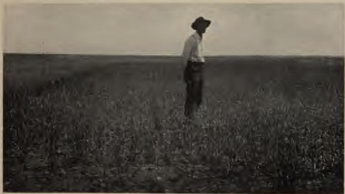
BARLEY GROWN CONTINUOUSLY, THIRD CROP, YIELD 6 BUSHELS PER ACRE, FORSYTH DRY-FARM, MONTANA

Showing evil effect of constant cropping without summer fallowing or rotation