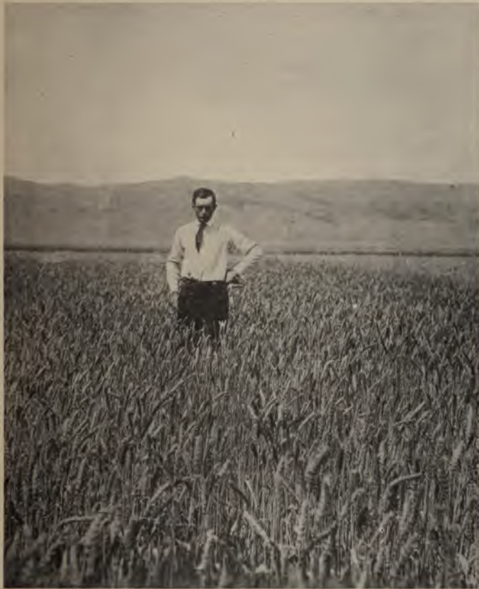
DRY-LAND WHEAT IN UTAH