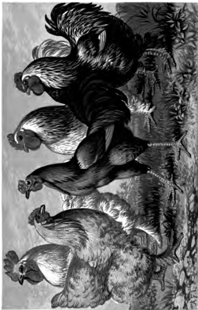
Buff and White Cochin-China.