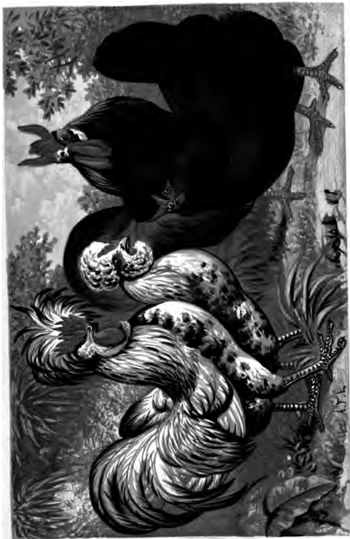
Cri ve cœur, hen.