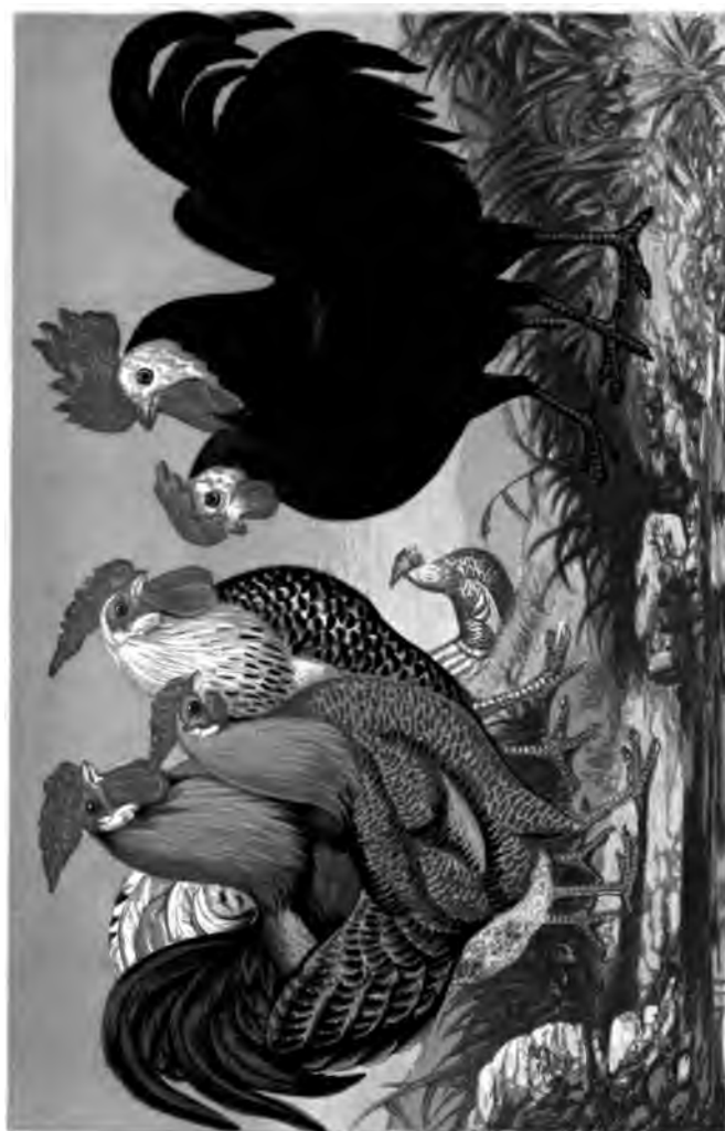
Golden-pencilled and Silver-spangled Hamburgs.