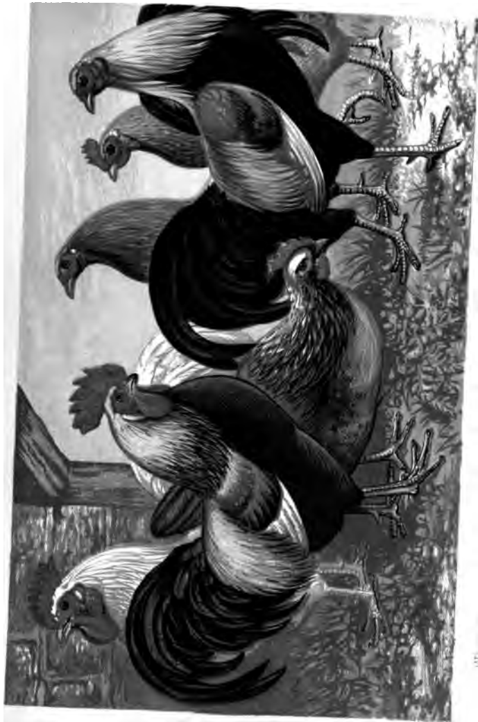
Illustration of five chickens, including three roosters and two hens, standing in a field. The roosters have large, dark, flowing tails and prominent combs. The hens have smaller combs and more rounded bodies. They are standing on uneven ground with some vegetation. The illustration is detailed, showing feathers and the texture of the ground.