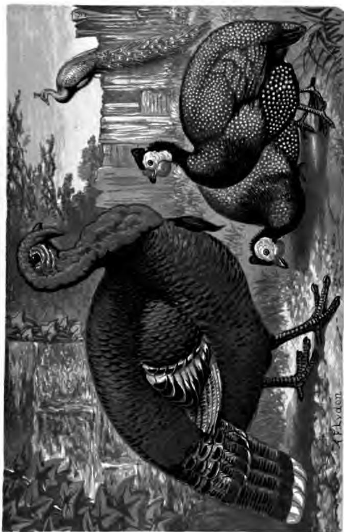
Turkey and Guinea-fowls.