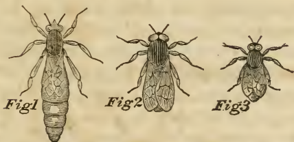
Fig. 1. represents the Queen ; Fig. 2. the Drone ; and Fig. 3. the Working Bee *.

* To those not much acquainted with bees, the following particulars may be useful.