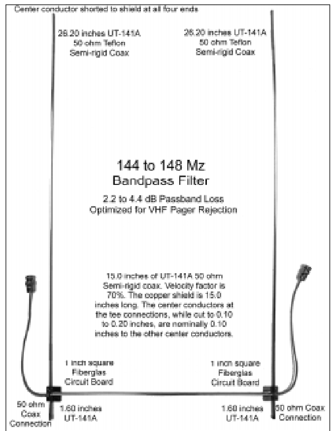
Figure 1—A view of the 2-meter no-tune bandpass filter showing the dimensions and wiring.