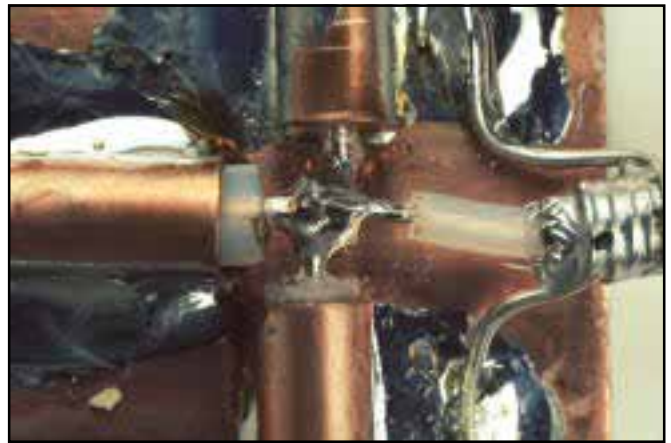
A close up of the T-junction connected to 50-Ω Teflon coax.

A significant disadvantage of transmission line filters is