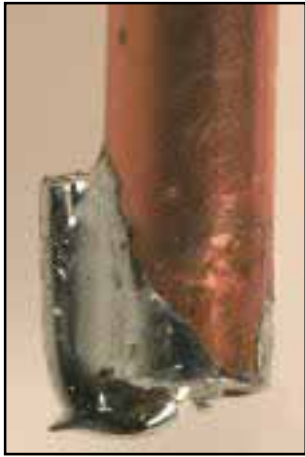
Here you can see how the center conductor is grounded to the shield.

harmonic responses. A half-wavelength filter is also resonant on its harmonics. This means that harmonic rejection is quite poor. A more conventional filter is suggested if you need good rejection above 170 MHz. Alternately, a low pass filter could be used in conjunction.